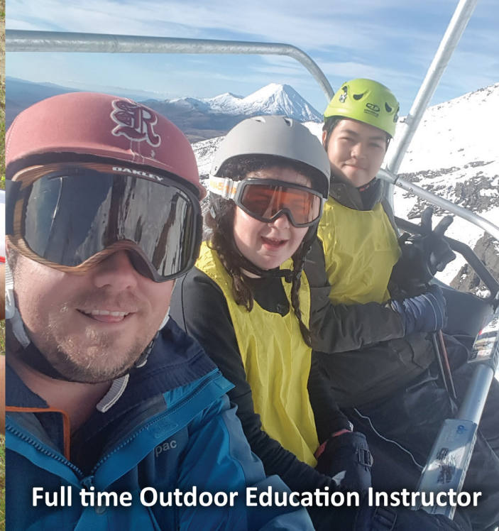
Full time Outdoor Education Instructor